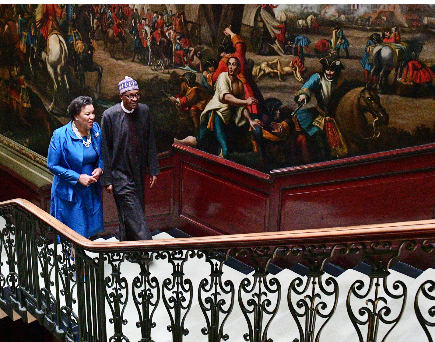
Commonwealth Secretary-General Patricia Scotland and President Buhari of Nigeria at the “Tackling Corruption Together” conference, Marlborough House, London, May 2016.

So you wind up in this curious situation. On the one hand, we know how to change corrupt cultures. It’s not just about resources. In countries at every income level, leaders can improve the integrity of their departments. And yet, it can be hard to find examples where the change has lasted through multiple changes in leadership. It really is first about leadership, then reinforcing structures and sustaining that change to build a lasting culture of integrity.