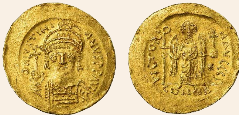
A gold ‘solidus’ coin, the obverse featuring Justinian I and, on the reverse, a standing angel; minted in Constantinople c.545-565.

Secondly, there were pragmatic reasons. Justinian wanted to extend the same legal jurisdiction to all parts of his empire. The law affected everyday people – when they bought goods or sold land; when they signed contracts or borrowed money; when they had disputes over inheritances or grievances over unpunished crime. Improving the legal system would make their lives more productive – and raise their approval of him as a leader. A more efficient legal system also promised to root out corruption, reduce waste, and in turn, bolster the Byzantine economy to make it one of the world’s most sophisticated and powerful marketplaces.