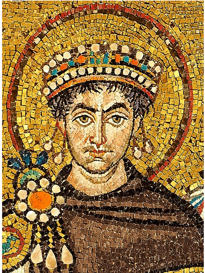
Detail of Mosaic of Emperor Justinian I and attendants, Basilica of San Vitale in Ravenna (built A.D. 547)

Justinian also refused to allow ‘great to be the enemy of good’. He ordered the first edition of a book on rulings to be published as soon as it was ready, rather than spend years trying to make it perfect. As it became clear that the compilation needed edits and amendments, a subsequent edition was published four years later. The particular wording of the Code mattered much less than the ideas it stood for and the ideals it defended. Justinian understood that legal decisions built upon the foundation of timeless principles – such as justice and fairness – stand the best chance of becoming timeless themselves.