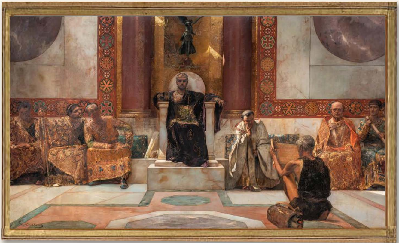
The Emperor Justinian, by Benjamin Constant (1886)