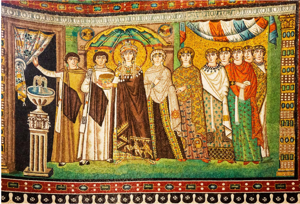
Mosaic of Empress Theodora and attendants, Basilica of San Vitale in Ravenna (built A.D. 547)

Many books have also been written about Justinian's wife - the charismatic and capable Theodora. She had a colourful early career as an actress but it was her intelligence and political acumen that made her Justinian's closest advisor and trusted counsellor. In a preface to one legislative ruling, Justinian admitted that he hadn't known what to do – so he asked Theodora.