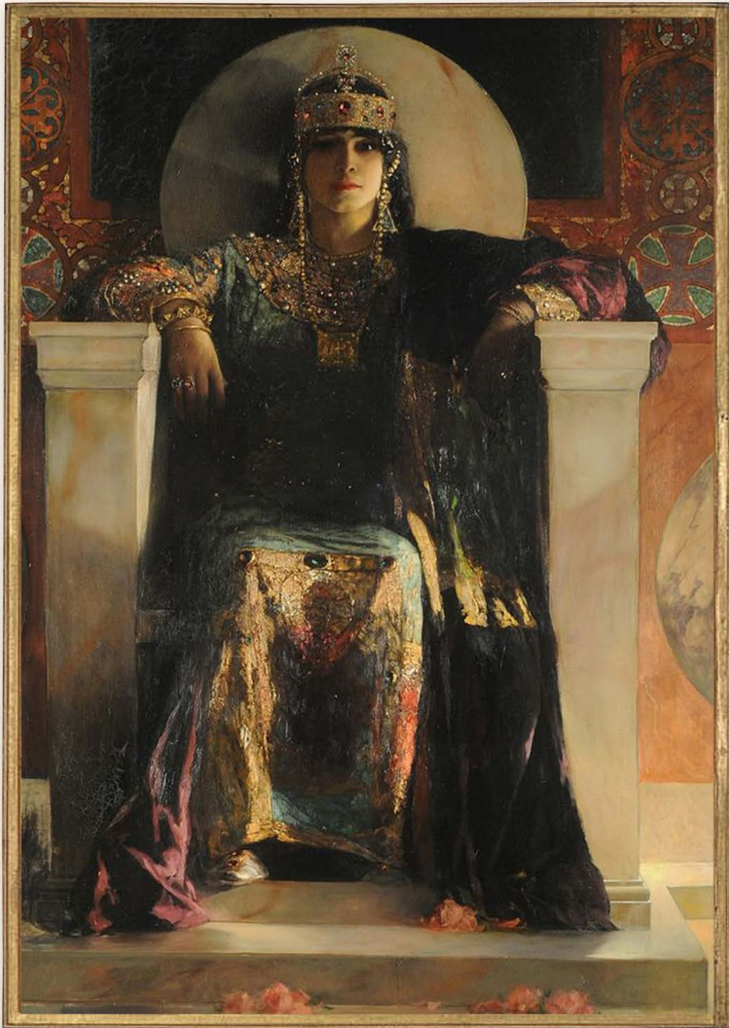
The Empress Theodora, by Benjamin Constant (1887)

Theodora's argument and her example carried the day. The riots were eventually quelled, and the pair ruled as a team until she died in 548.