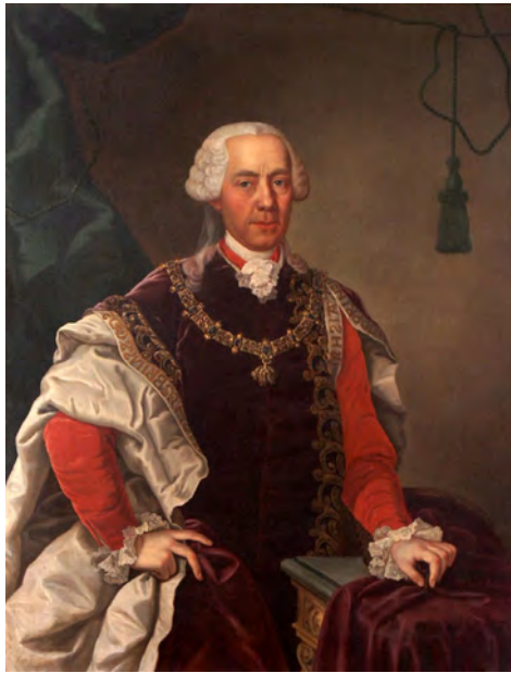
Friedrich Wilhelm von Haugwitz

In 1747 Haugwitz had been first appointed to reform the administration of Carinthia and Carniola. Proving himself, he swiftly rose to become Maria Theresa's most powerful advisor during the early years of her reforms. Maria Theresa wrote of Haugwitz, "He was truly sent to me by Providence, for to break the deadlock I needed such a man, honourable, disinterested, without predispositions, and with neither ambition nor hangers-on, who supported what was good because he saw it to be good..."