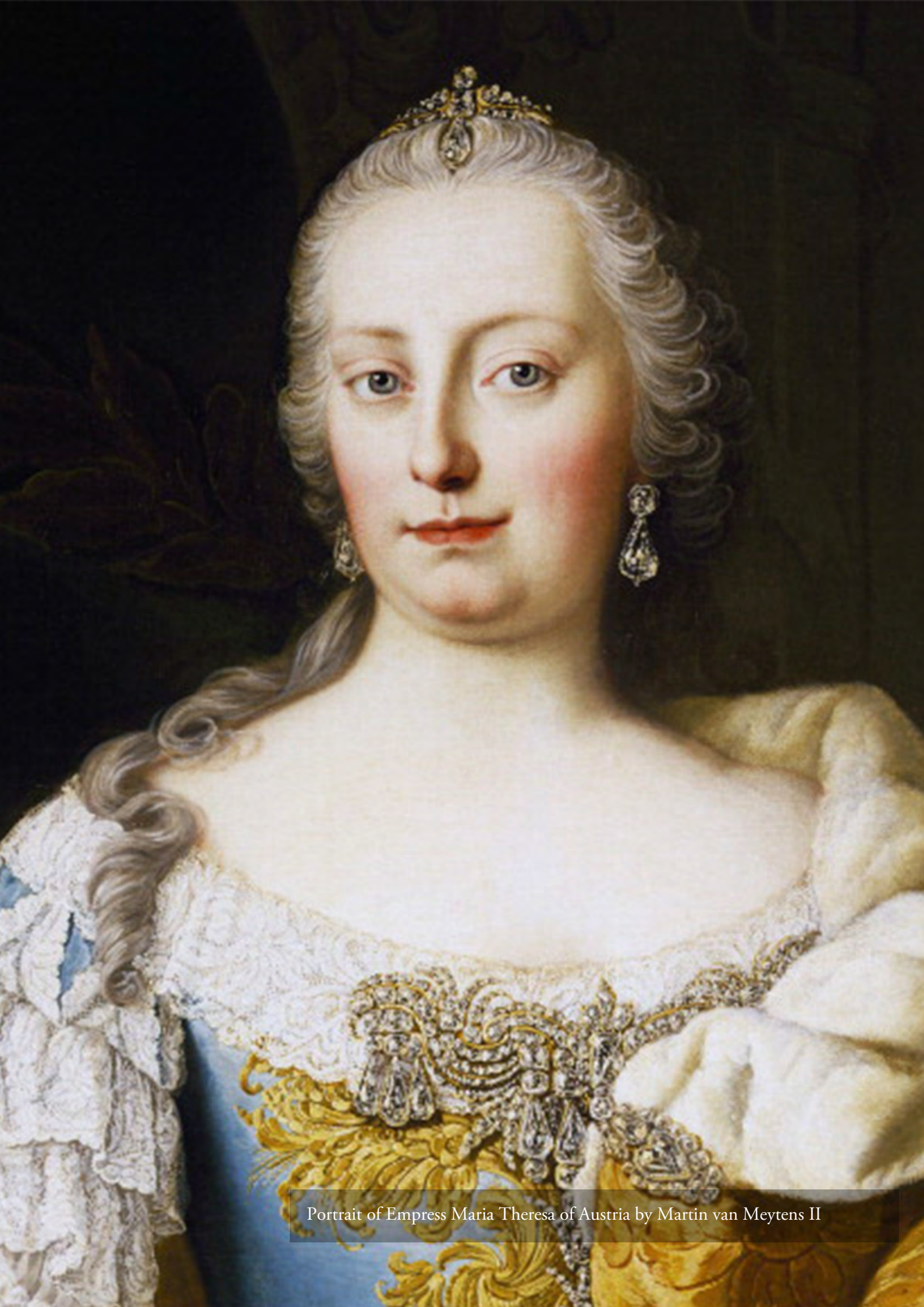
Portrait of Empress Maria Theresa of Austria by Martin van Meytens II