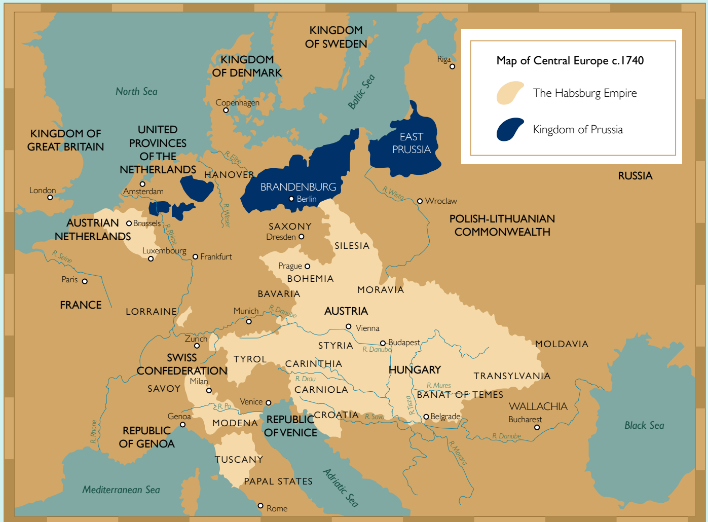
Map showing the extent of the Habsburg dominions across Europe, c. 1740, when Maria Theresa acceded to the throne.