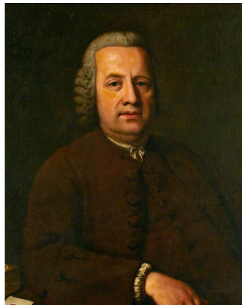
Dr Gerhard van Swieten

Another key figure was the queen's personal physician, the Dutchman Dr Gerhard van Swieten. He led important modernising reforms to health services and the education of medics. He became president of the medical faculty at the University of Vienna, where he introduced textbooks and linked the medical school to public health initiatives. He was even tasked with investigating and stamping out unhygienic burial practices in parts of the empire that were linked to local superstitions about vampires! He was instrumental in convincing Viennese physicians to inoculate against smallpox, the leading cause of death in Europe in the 18th century.