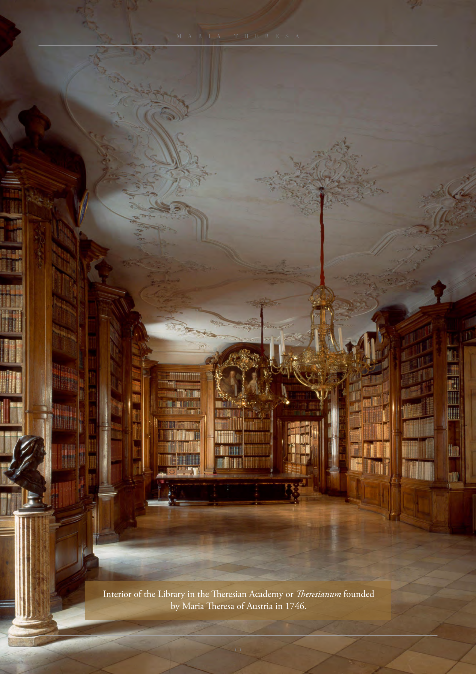
Interior of the Library in the Theresian Academy or Theresianum founded by Maria Theresa of Austria in 1746.