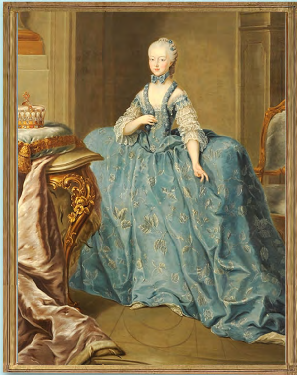
Archduchess Maria Johanna Gabriela of Austria (1750-1762), the eleventh child of Maria Theresa. She died aged 12 of smallpox, one of four of Maria Theresa's 16 children who succumbed to the disease.